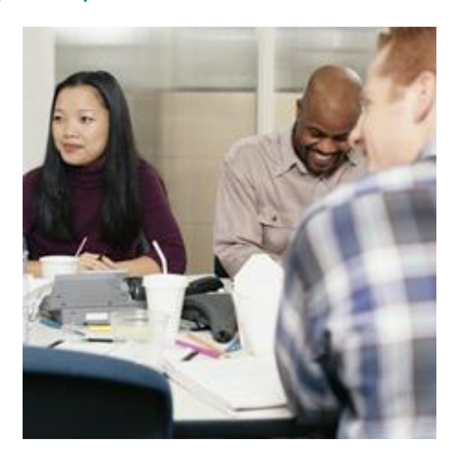
JSM payroll software contains the following Sections and Modules.

JSM Payroll is integrated software that has more than 50 Modules covering Employee Master, Employee Transactions, Leave and Attendance, Payroll and Statutory Modules – NPS, GPF, CGEIS, CGHS and TDS. JSM Payroll gives you tremendous flexibility to set rules as per your specific requirements.